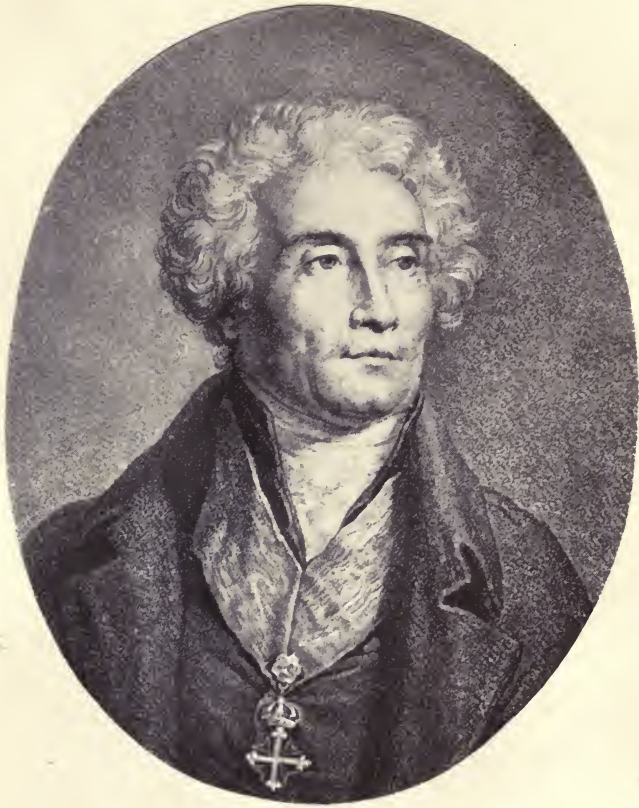
JOSEPH DE MAISTRE.